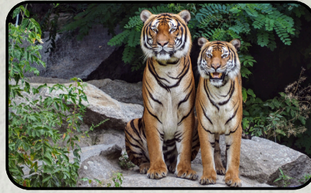
Tadoba Andhari Tiger Reserve