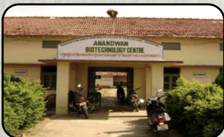
Anandvan Ashram, Warora