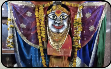
Mahakali Temple, Chandrapur